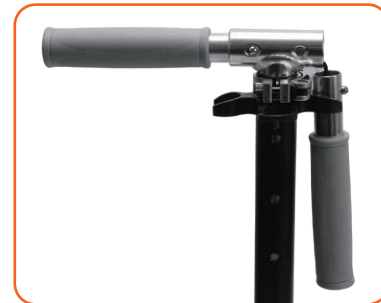
Assemble the handle bars