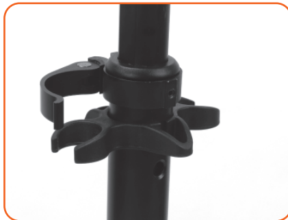
Adjust the height after unfolding the clamp, if the screws is loose, please tight it