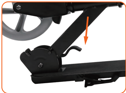
Step on the lever