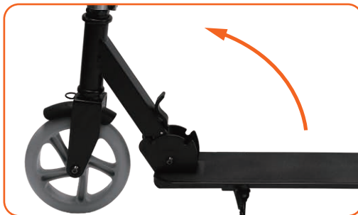
Unfold the scooter