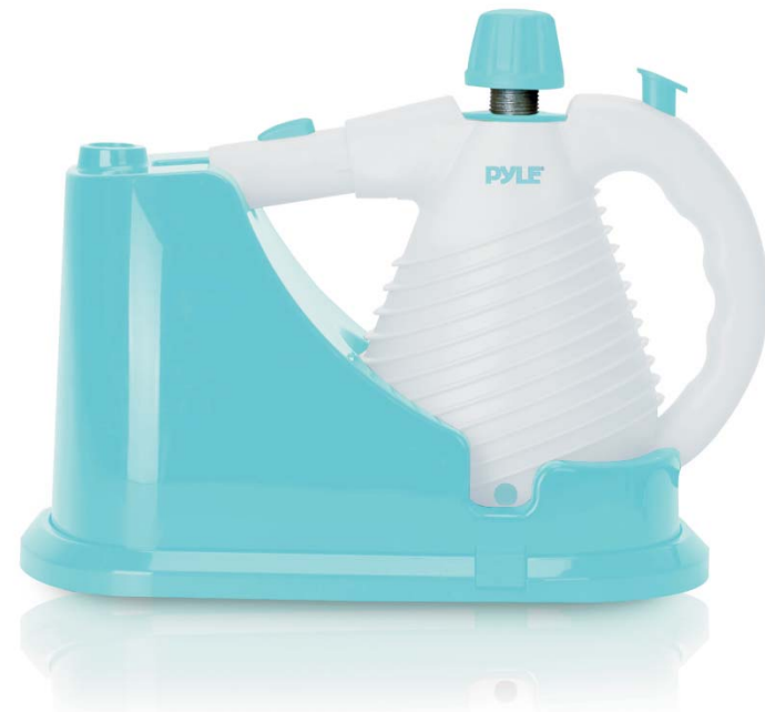
PSTMH15 Multi-Purpose & Multi-Surface Steam Cleaner w/ Hanging Garment Rack, 900 Watt