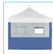
FOOD BOOTH SIDEWALL