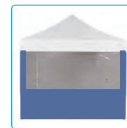
HALF PANORAMA WALL

All accessories or custom graphics can be ordered online visit us at www.SerenelifeHome.com