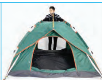
5. Gently shake the tent