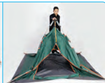
3. Hold with both hands and lift it up