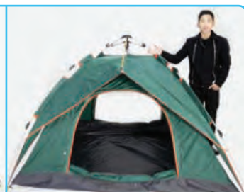
6. Tent construction is complete