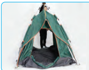
4. Put down when it comes to the top