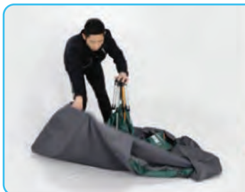
1. Open the half corners of the tent